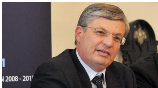
Mr. Tonio Borg, European Commissioner for Health and Consumer Policy