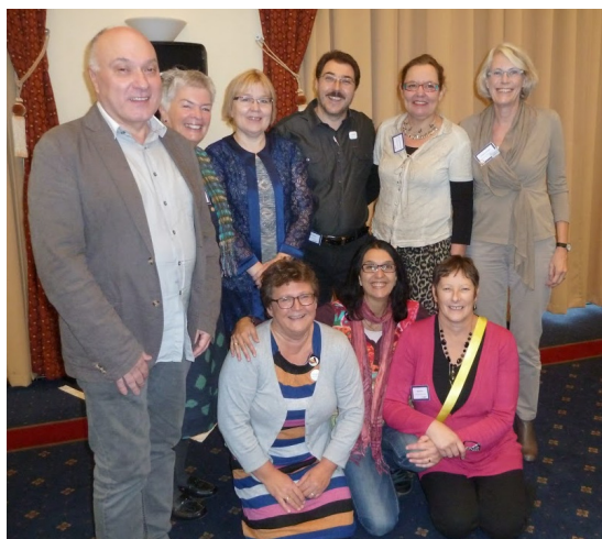
The previous and new board members of ENOTHE